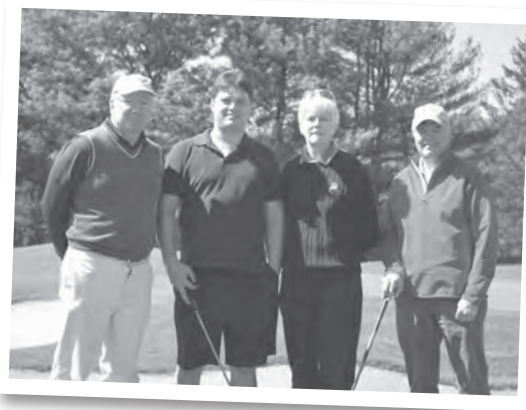
Team KSE, LLP poses for a group photo

The RHF Golf Invitational was back again, raising funds for programs of Rutland Regional Medical Center and RAVNAH. Participants were in great spirits as they enjoyed breakfast, a beautiful sunny day, and an awards luncheon following the captain and crew format tournament.